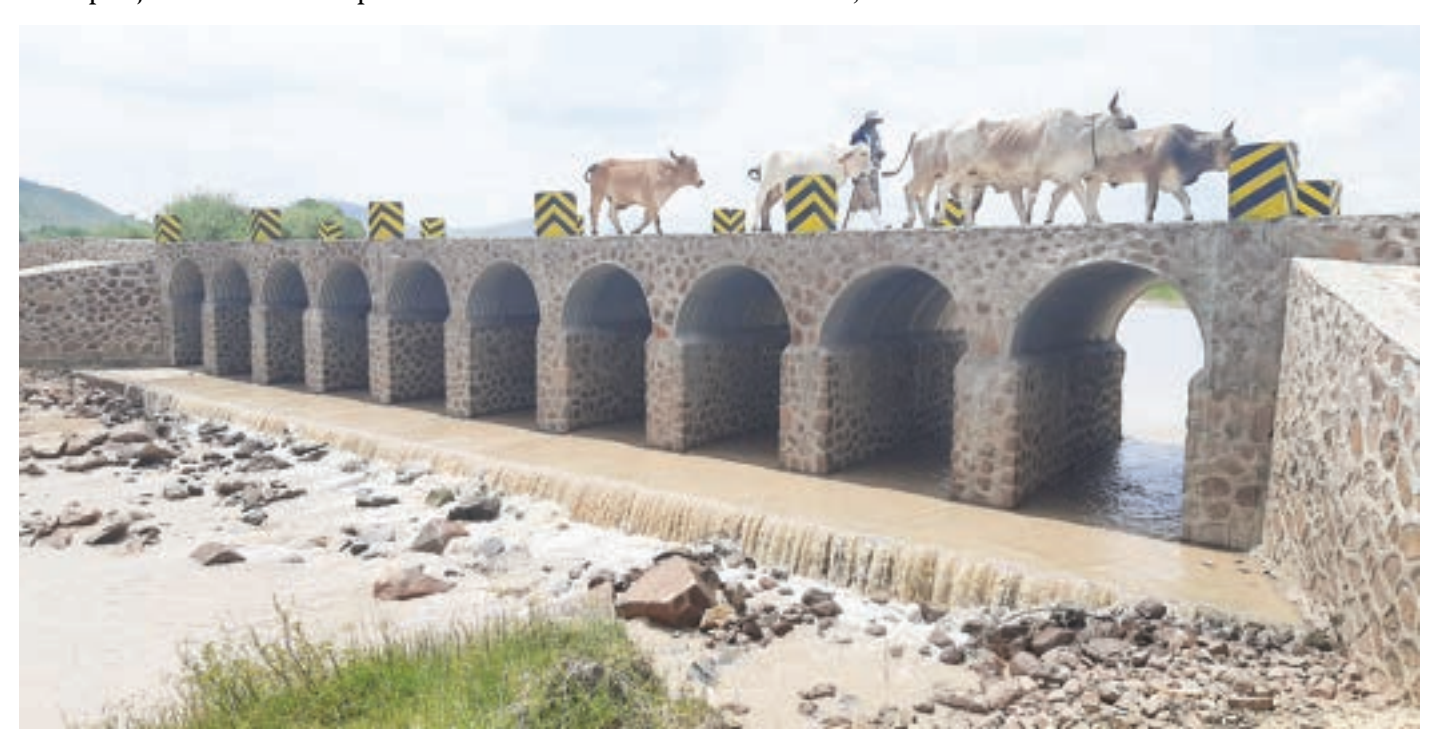
Routine Maintenance of Bongalla to Maoela Road - Construction of a Vented Ford

The project is now complete has cost Road Fund about M5,1 Million.