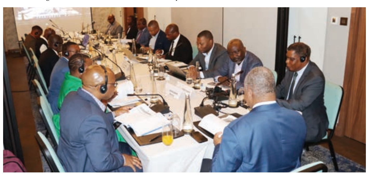
ASAFG Meeting in Session in Lusaka, Zambia

The ASAFG meeting is hosted at least twice a year and it rotates amongst members. It is a platform for collaboration and concerted efforts amongst members, the last ASAFG meeting was hosted by the Road Fund in Angola.