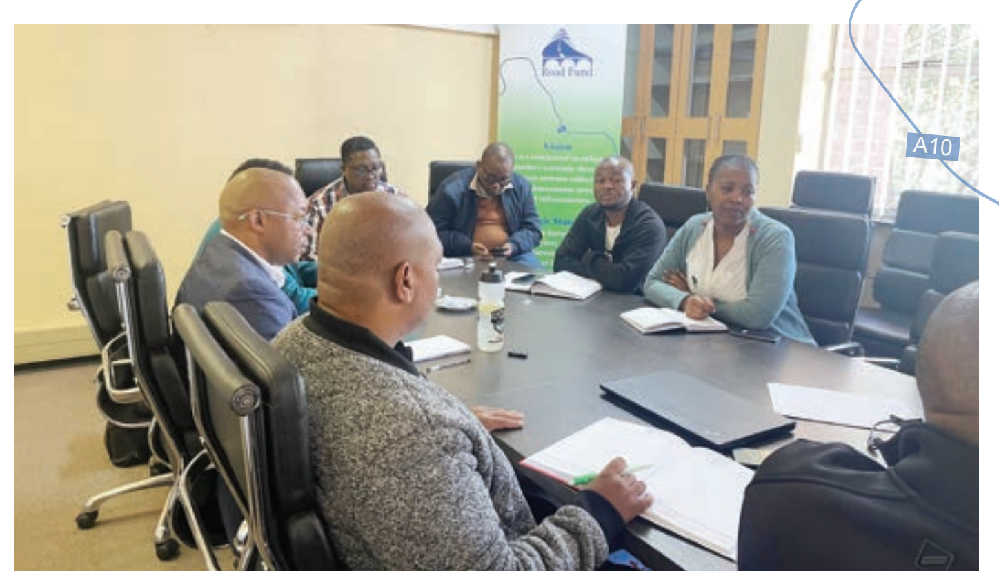
Part of particpants at the Stakeholder Engagement Meeting