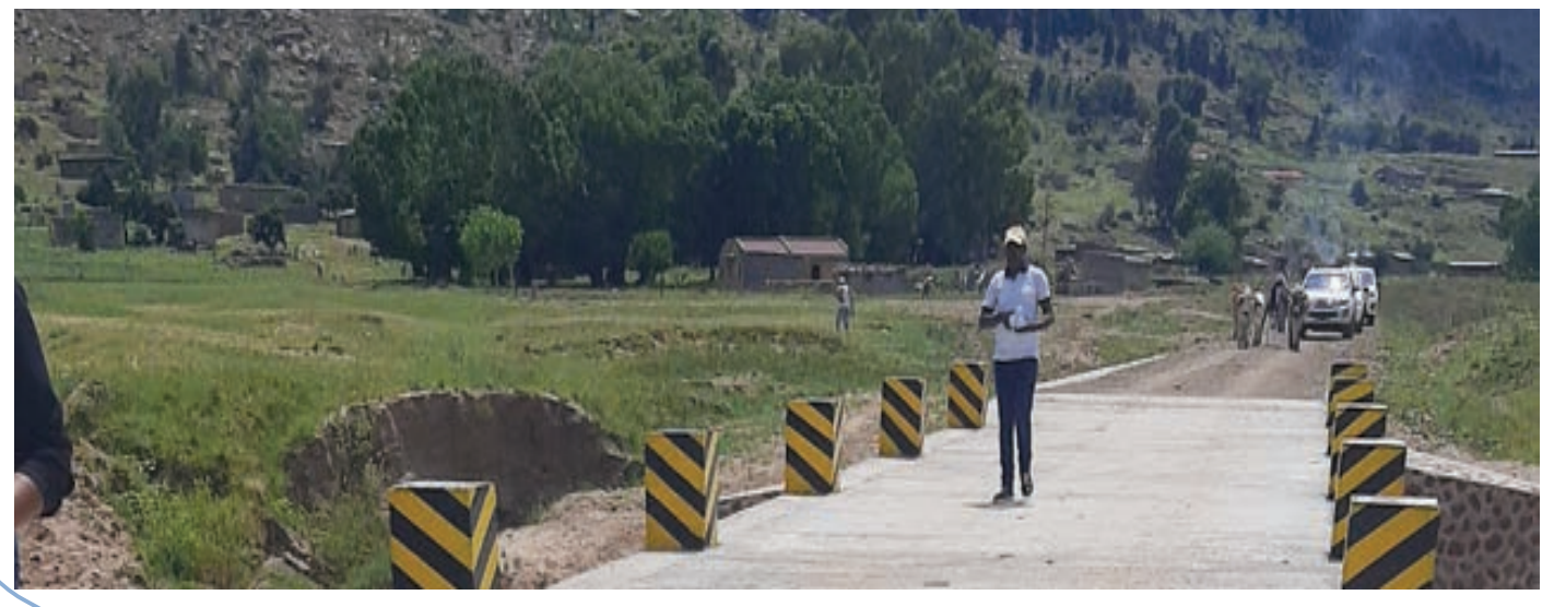
Routine Maintenance of Bongalla to Maoela Road- Construction of a Vented Ford