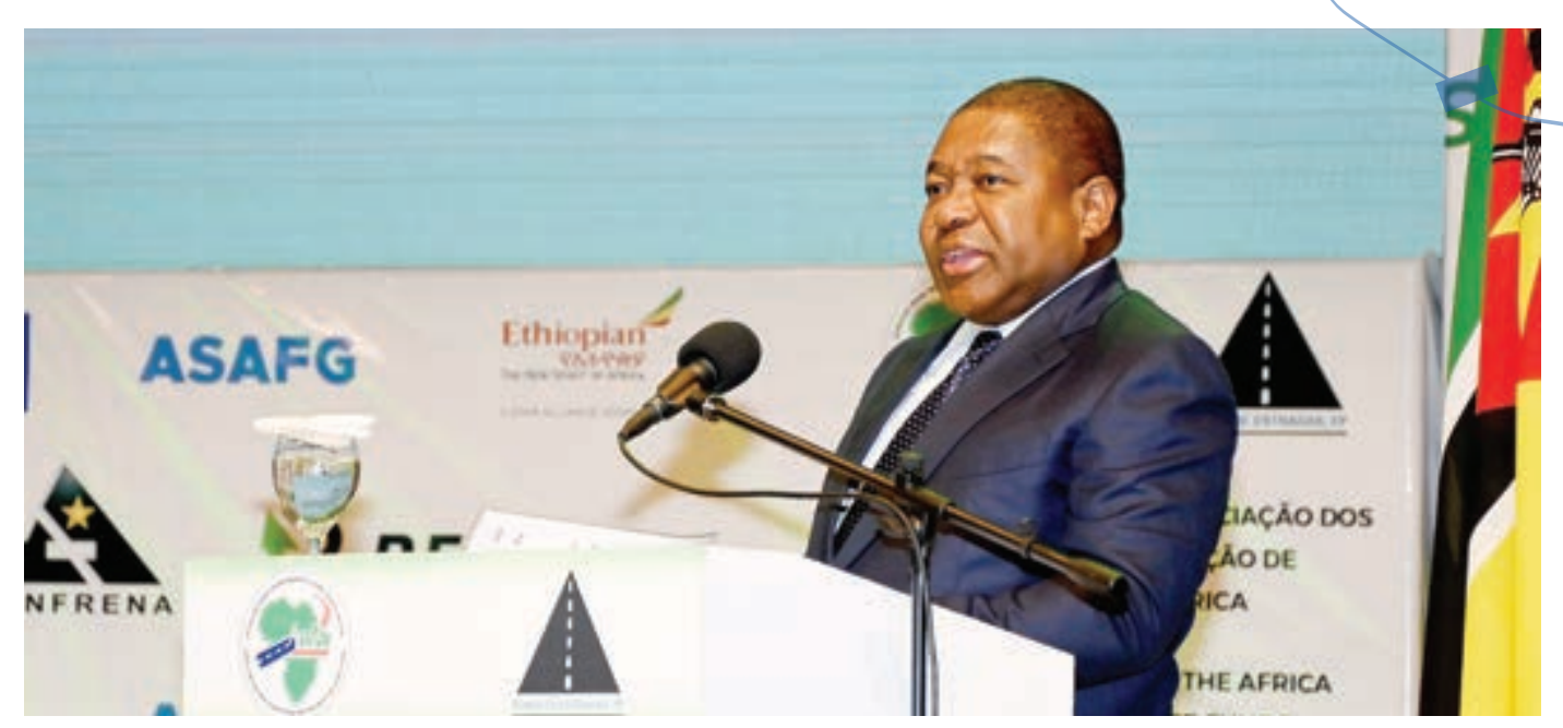
The President of Mozambique while officially opening the ARMFA Annual General Assembly

introduced ARMFA to the participants, indicating that the Association was founded in Gabon in 2003, then by 18 members. He said today ARMFA has evolved and counts 36 members representing about 2/3 of Road Funds in Africa.