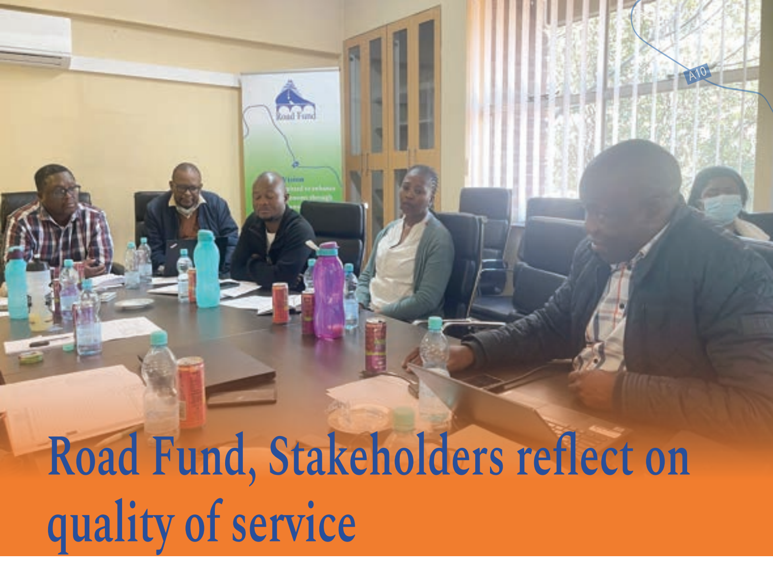
Road Fund Head of Engineering addressing participants at the Stakeholder Engagement Meeting

The Road Fund and its Stakeholders have reflected on the quality of service they offer to the customers, being the road users, during a Stakeholder Engagement Meeting organized by the Road Fund, at their offices in Maseru.