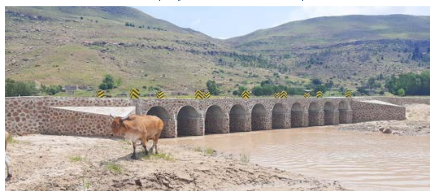
Routine Maintenance of Bongalla to Maoela Road-Construction of a Vented Ford