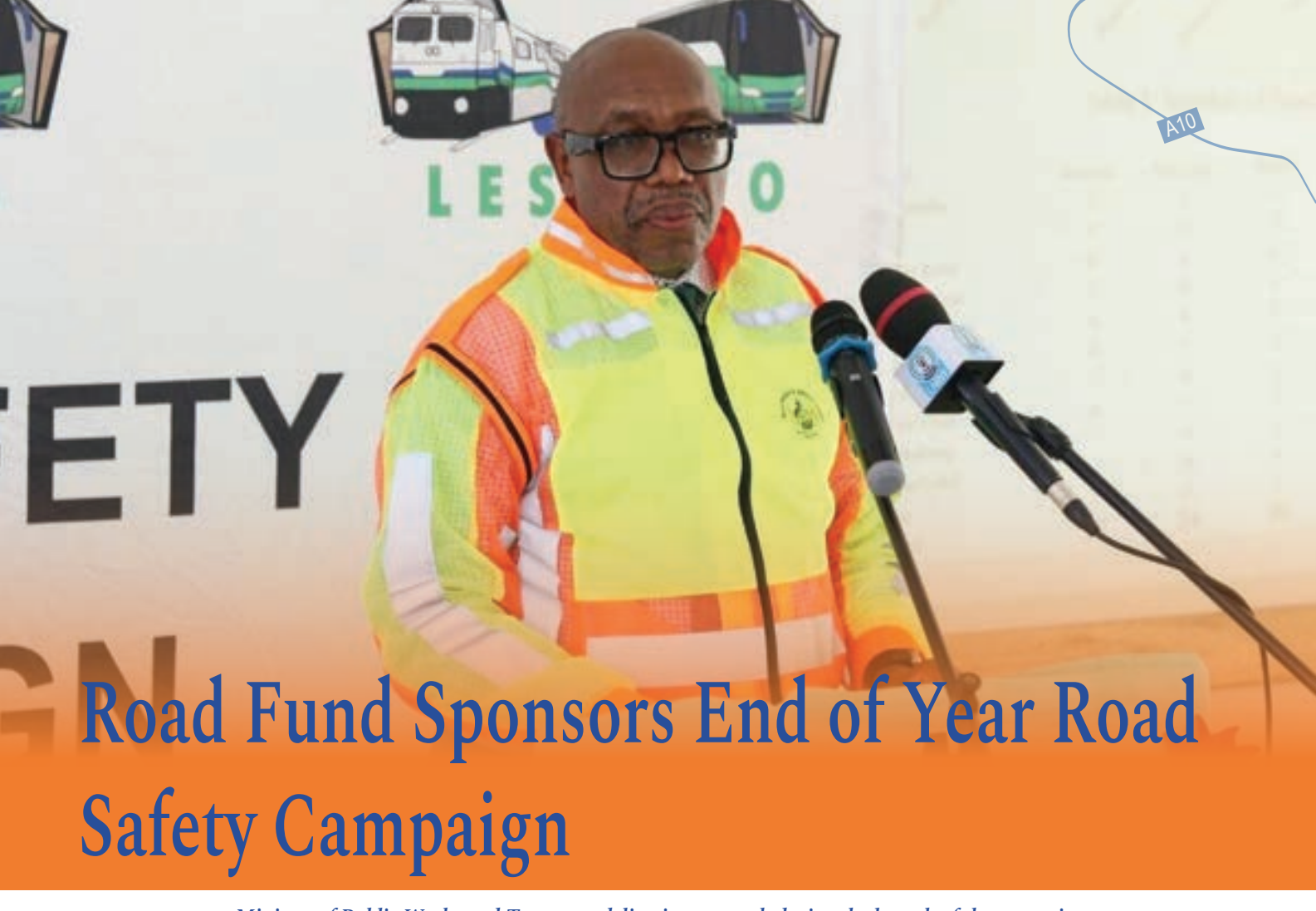
Minister of Public Works and Transport delivering a speech during the launch of the campaign

In a quest to fulfil part of its mandate, which is to promote road user safety programmes, Road Fund has sponsored the Road Safety Annual End of Year Campaign.