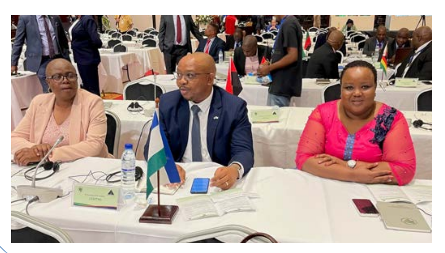
The Road Fund CEO, Heads of Finance and Corporate Communications during the ARMFA AGA in Mozambique

They will serve the Association for the coming two years.