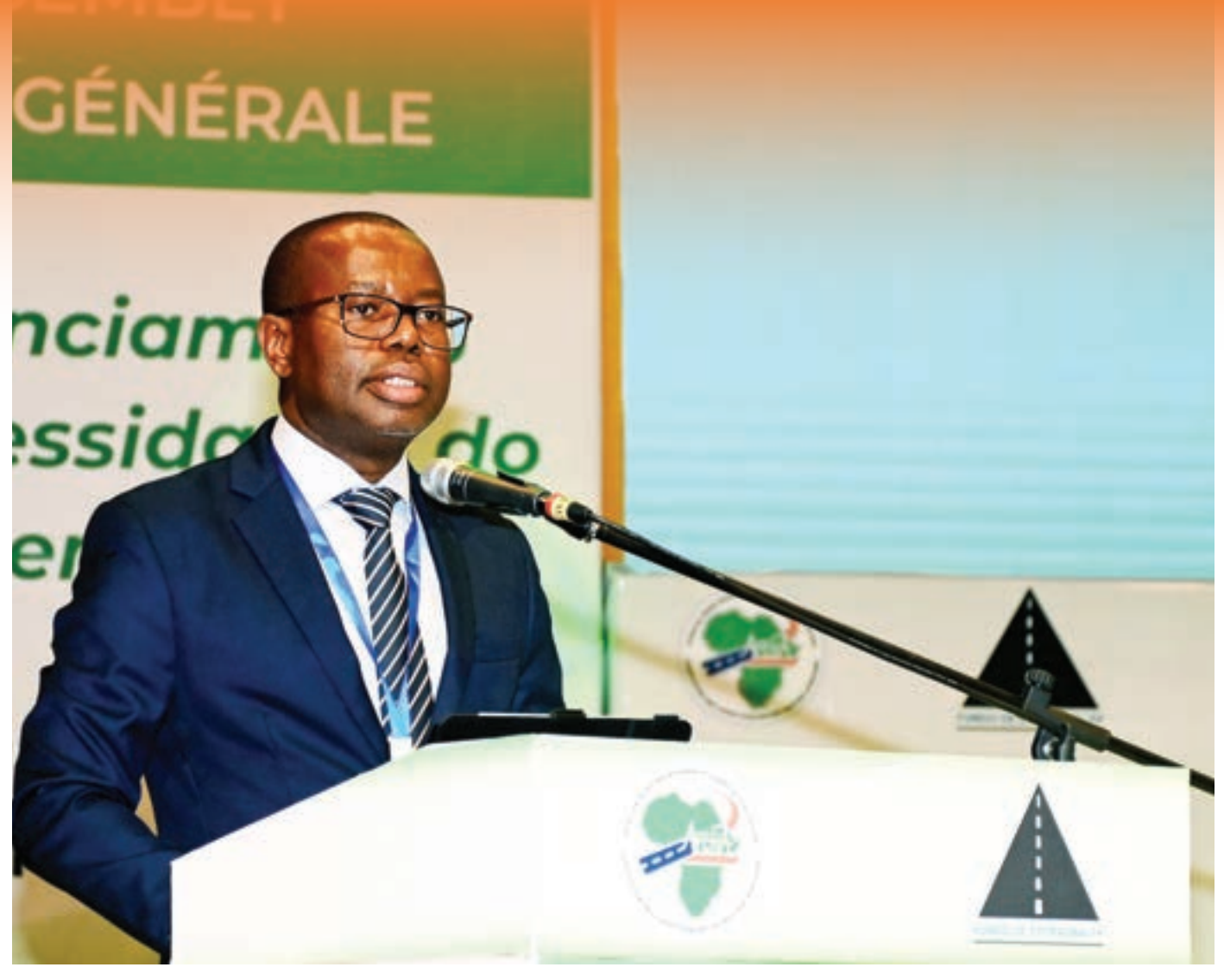
The ARMFA President delivering his speech at the ARMFA Annual General Meeting is Mozambique

The new African Roads Maintenance Funds Association (ARMFA) Executive Committee was elected during the recent ARMFA Annual General Meeting (AGM) hosted by the Road Fund in Mozambique.