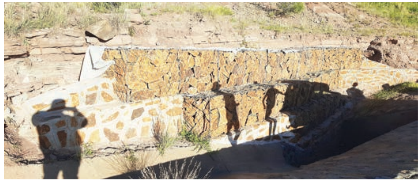
Routine Maintenance of TY to Kubetu Road