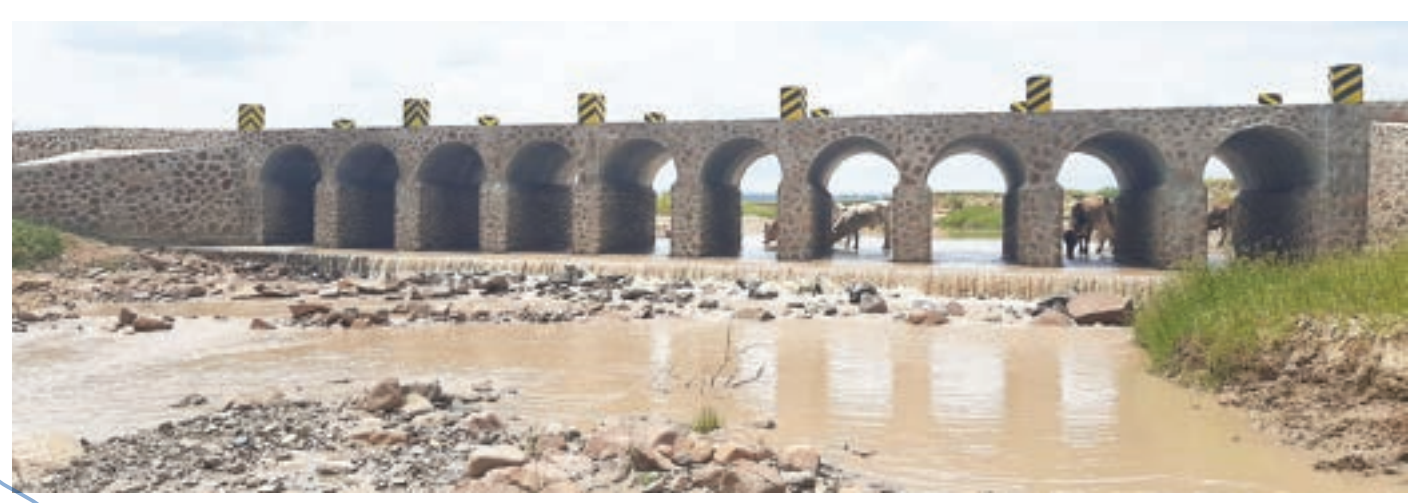
Routine Maintenance of Bongalla to Maoela Road - Construction of a Vented Ford