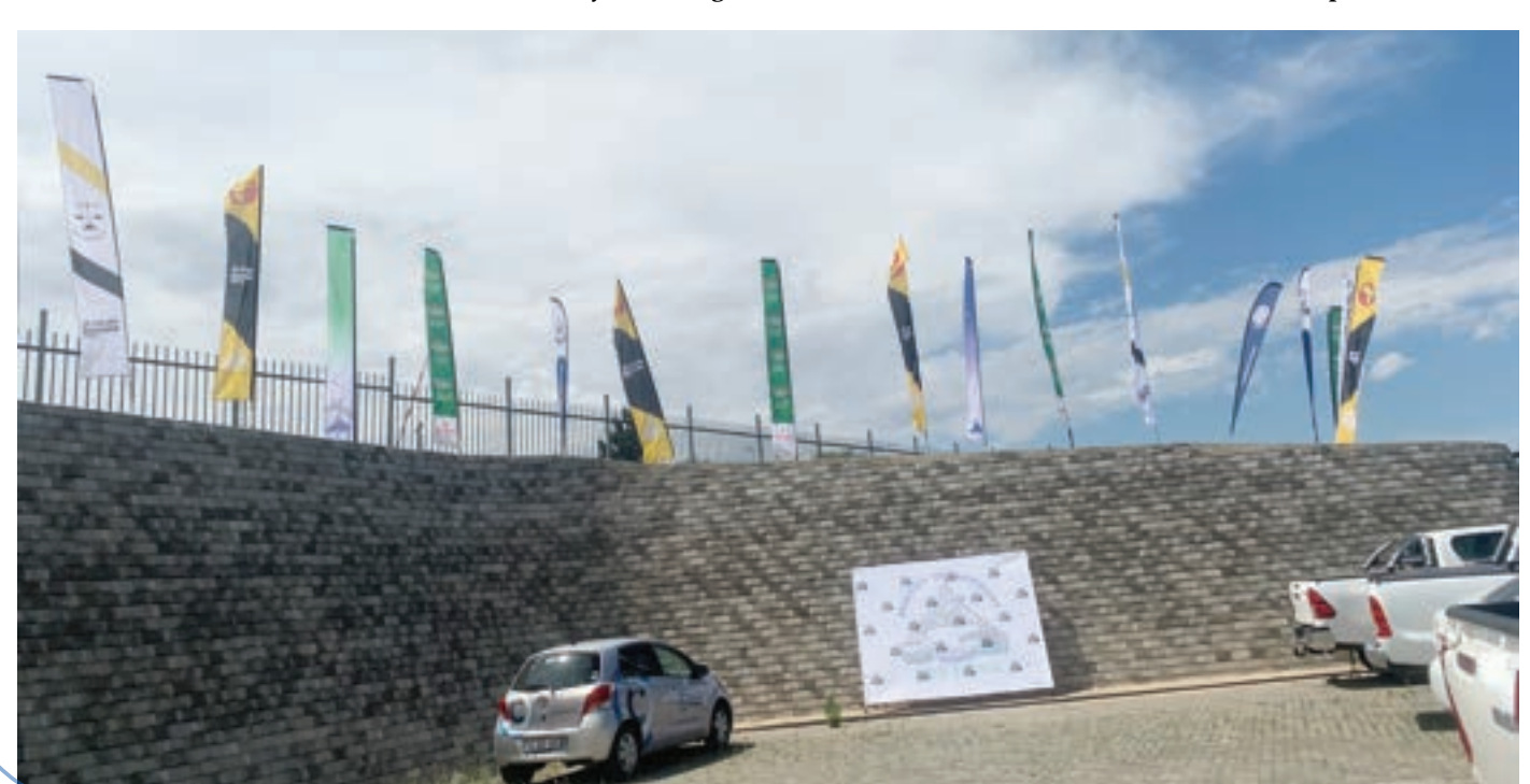
Display of publicity banners by sponsors during the launch of the campaign

The campaign is held annually under different themes and Road Fund is its main sponsor.