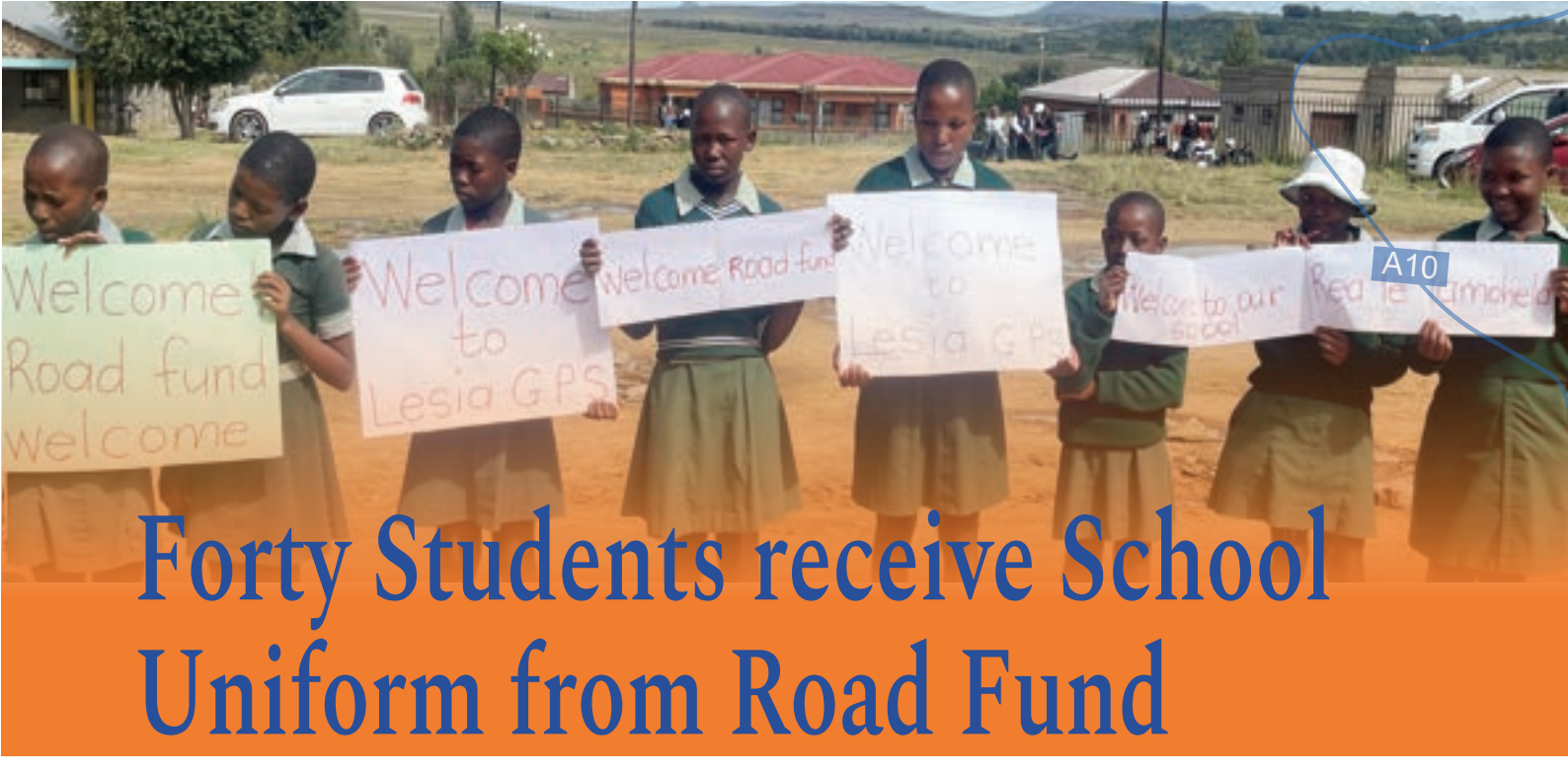
Lesia Primary School students welcoming Road Fund to their School

A total of forty (40) vulnerable students of Lesia Primary School in Maseru received full packages of School Uniform as per their individual needs, during the recent Corporate Social Responsibility event hosted by the School.