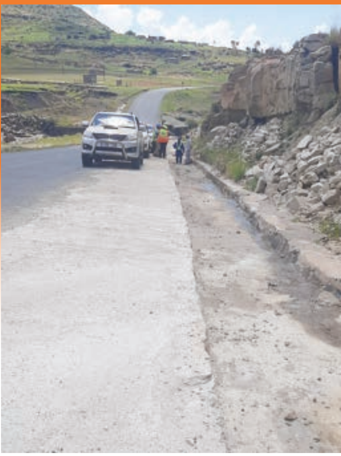
Routine Maintenance of Mafeteng to Thabana Morena Road

During the last Financial year, Road Fund has sponsored Roads Directorate to undertake Routine Maintenance of B26 Mafeteng-Thabana Morena paved road.