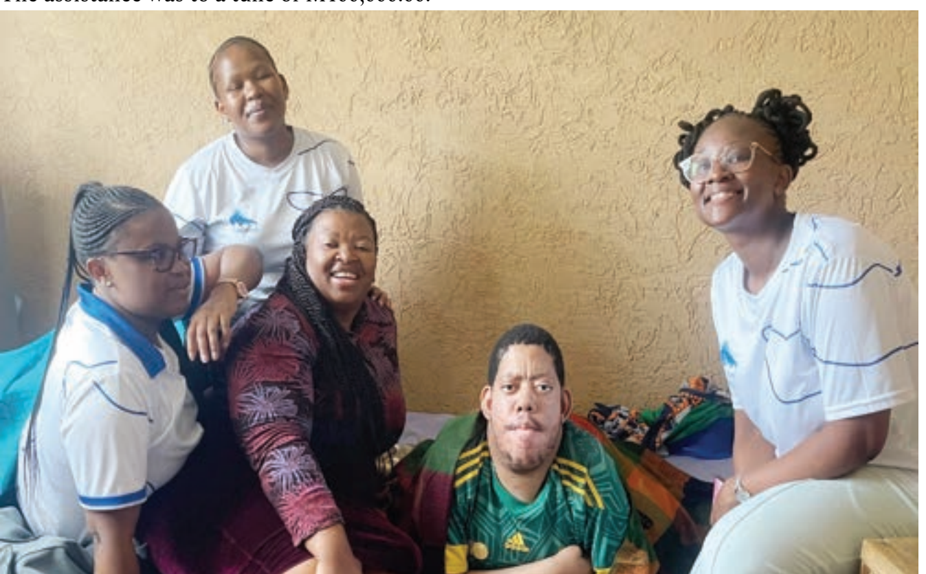
One of the beneficaries identified under the disability category in Berea posed for a picture

The assistance was to a tune of M100,000.00.