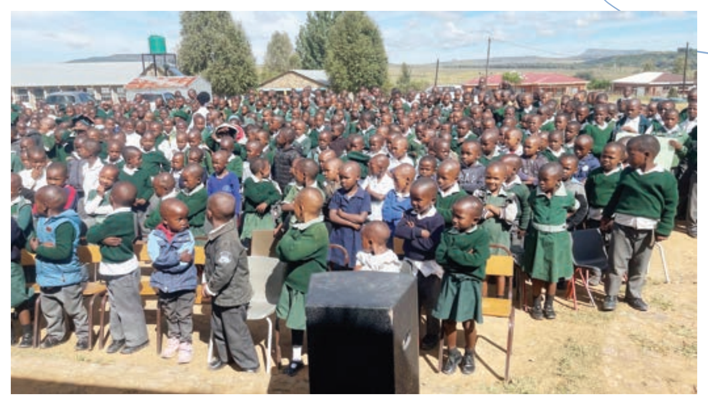
Part of Lesia Primary School students during the handing over of School uniform ceremony