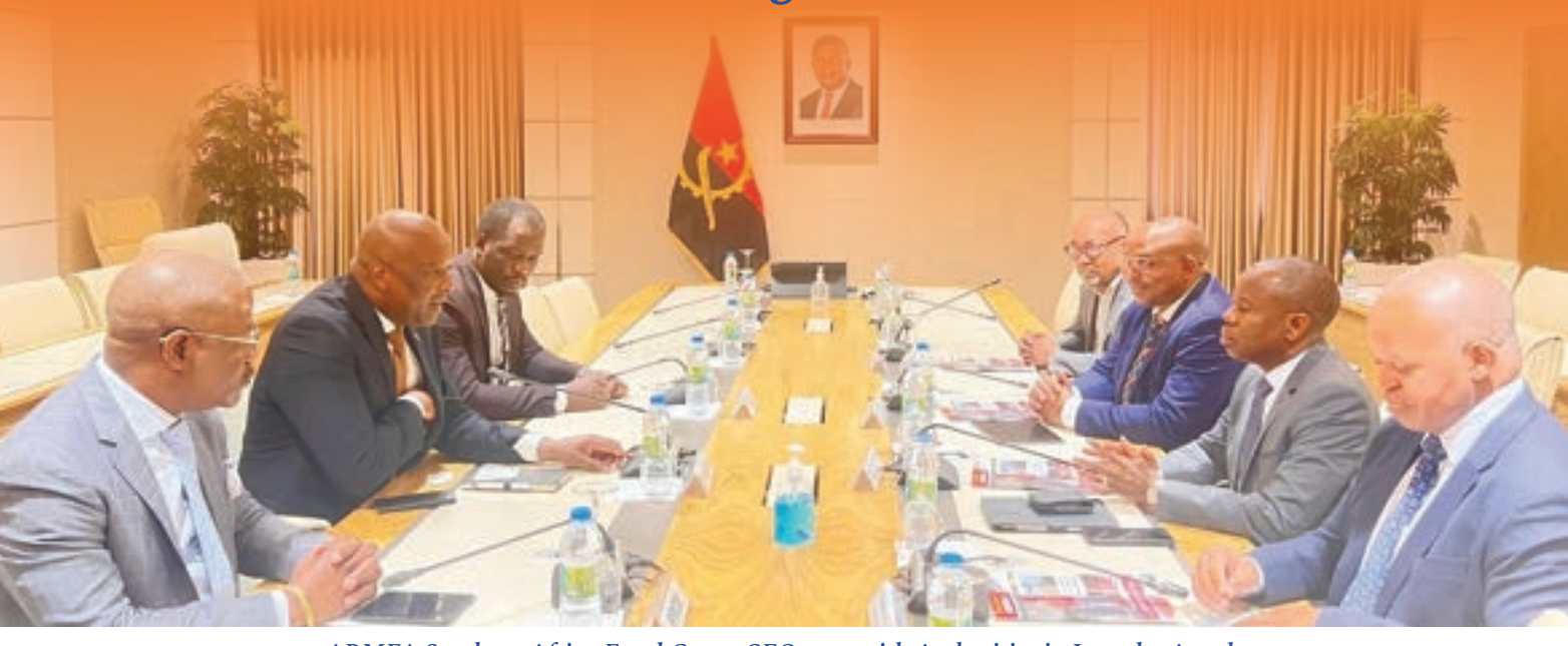
ARMFA Southern Africa Focal Group CEOs met with Authorities in Luanda, Angola

for Sustainable Financing of Road Infrastructure