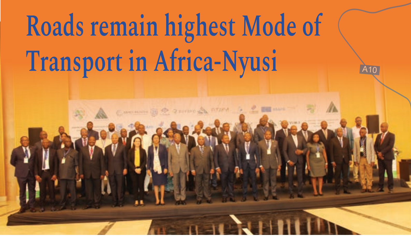
Delegates at the ARMFA General Assembly hosted by Mozambique Road Fund

Roads remain the highest mode of transport in Africa; they provide links for collaboration and movement of passengers and goods for business and leisure within the African continent; thereby generating great reliance for them to remain in good condition.