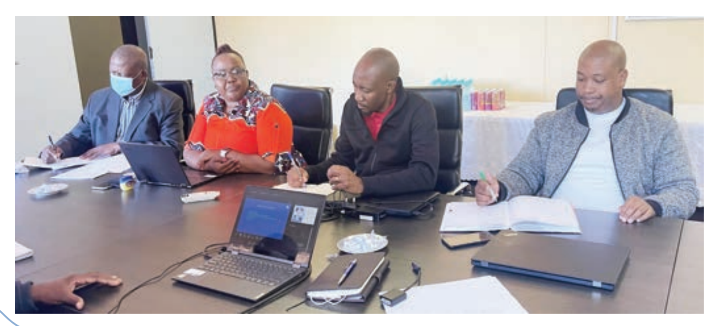
Part of participants at the Stakeholder Engagement Meeting

The Road Fund maintains relations with the Agencies both at Technical level and at high level led by the Principals.