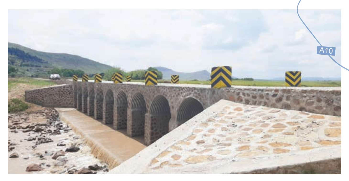
Routine Maintenance of Bongalla to Maoela Road-Construction of a Vented Ford