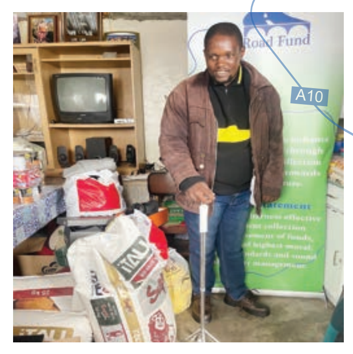
Road Fund Staff and Ministry of Social Development Thaba Tseka posing with the beneficaries in Katse

that it was her Ministry's responsibility to take care of the disabled, but are mostly hindered by lack of funds to reach all beneficiaries at time.