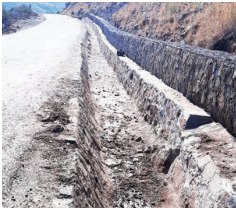
Plant and Design Build Repair of Meriting Culvert