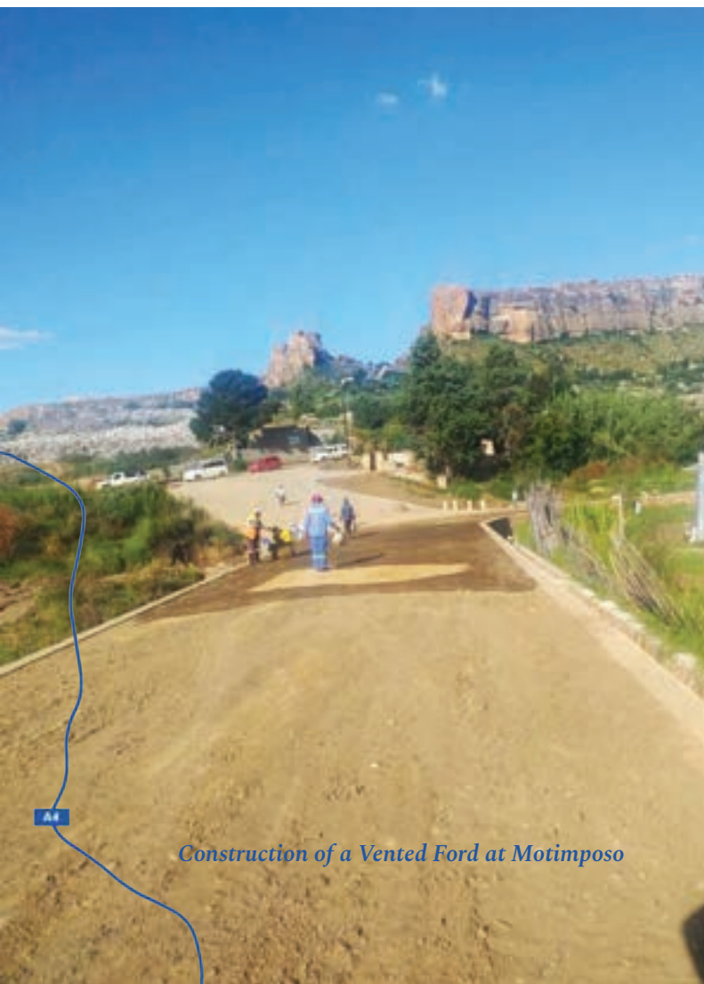
Construction of a Vented Ford at Motimposo