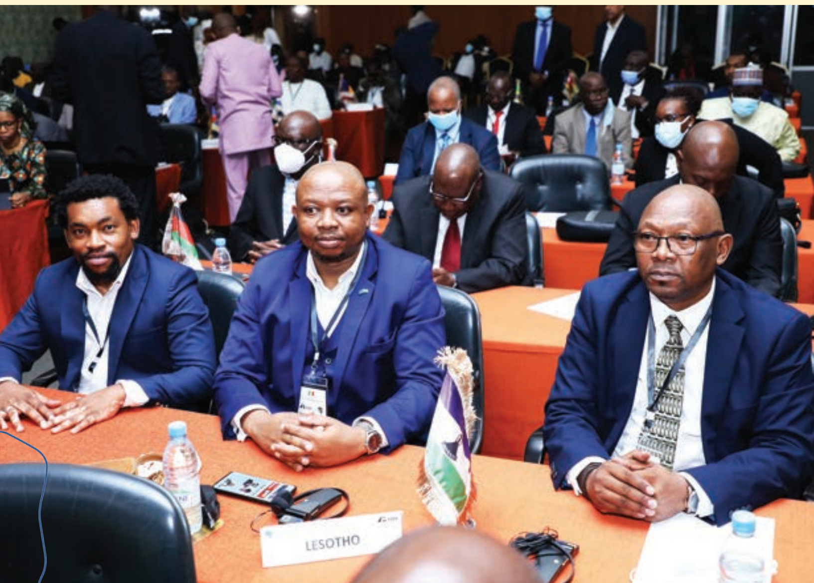
Road Fund Board Chairperson, CEO and Compliance Manager during ARMFA AGA opening ceremony

To ensure a coordinated management of ARMFA, member countries have been clustered into four regional focal groups; West African Focal Group, Southern African Focal Group, Central African Focal Group and East African Focal Group.