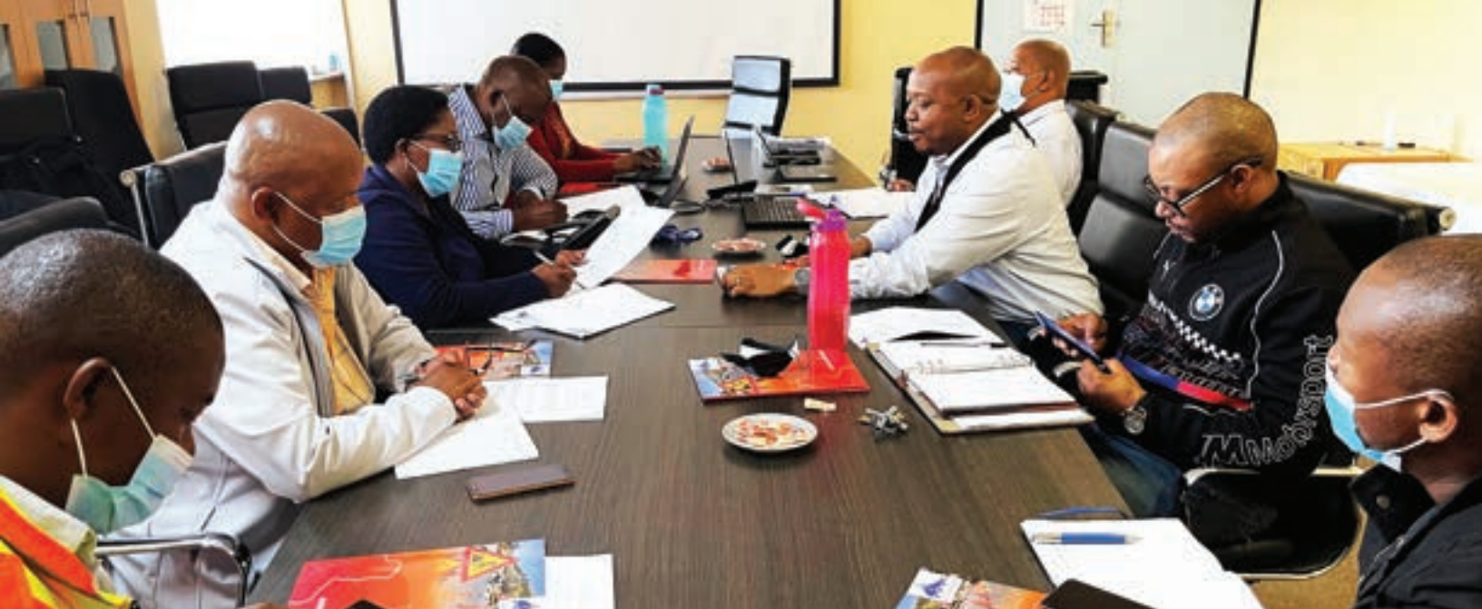
Road Fund CEO with participants of the Stakeholder Engagement Meeting