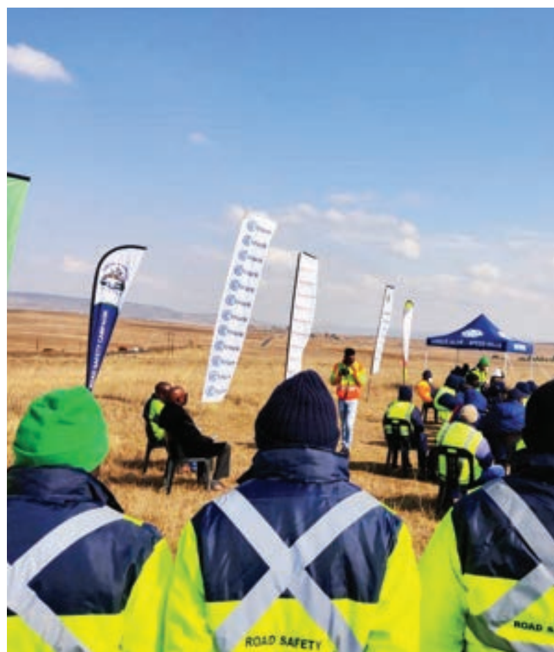
Part of the Officials who attended the campaign launch