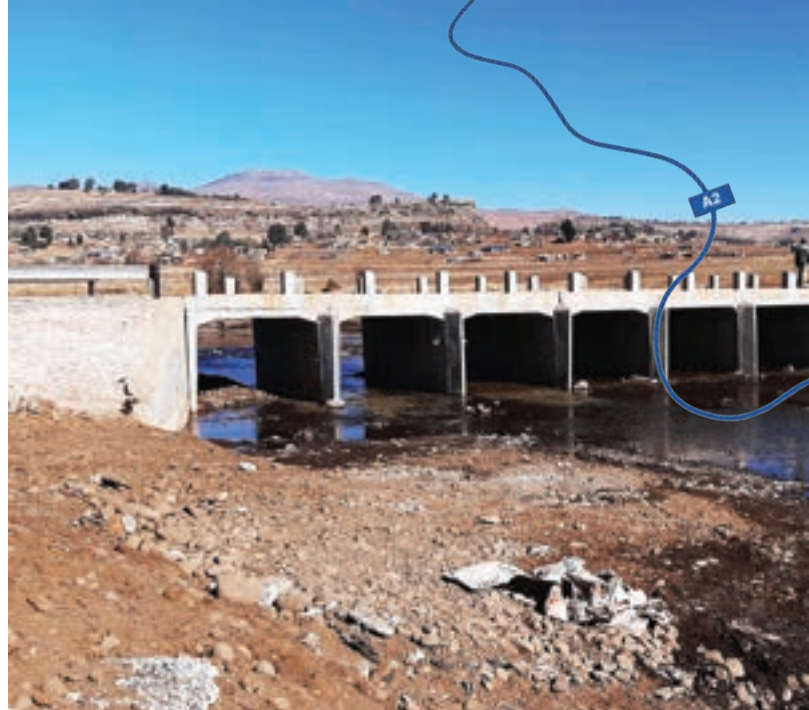
Plant and Design Build Repairs of Hlotse Crossing-Construction of a Mini bridge Konkotia to Pentsi