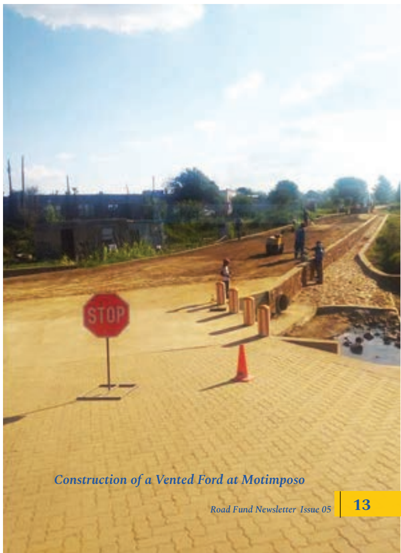
Construction of a Vented Ford at Motimposo