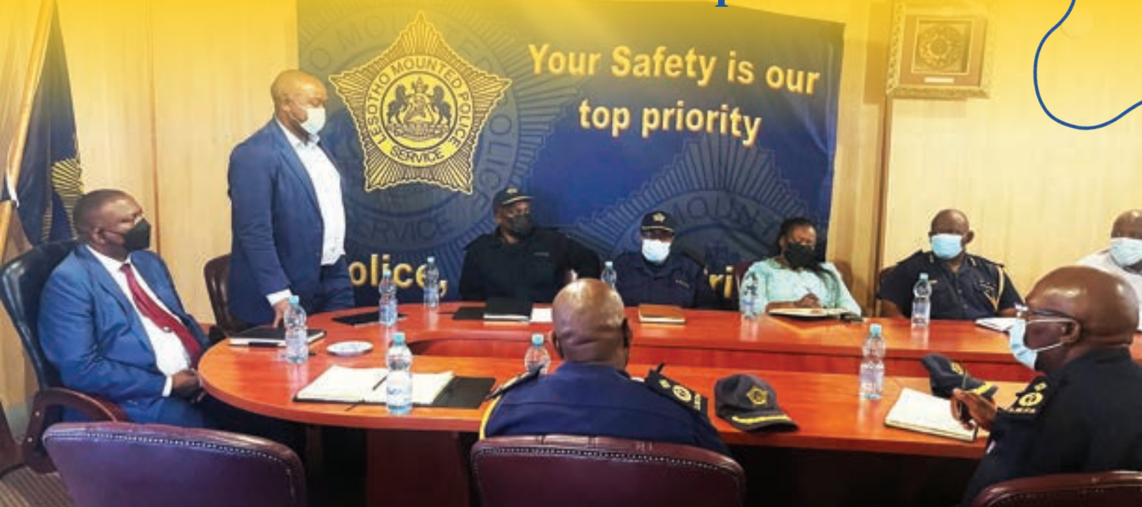
Road Fund CEO and Commissioner of Police during one of the stakeholder engagement meetings

Five Officials representing the Botswana Police Service and Ministry of Transport and Communications recently visited the Lesotho Mounted Police Service (LMPS) on a benchmarking exercise of the electronic Spot Fine (eSpot Fine).