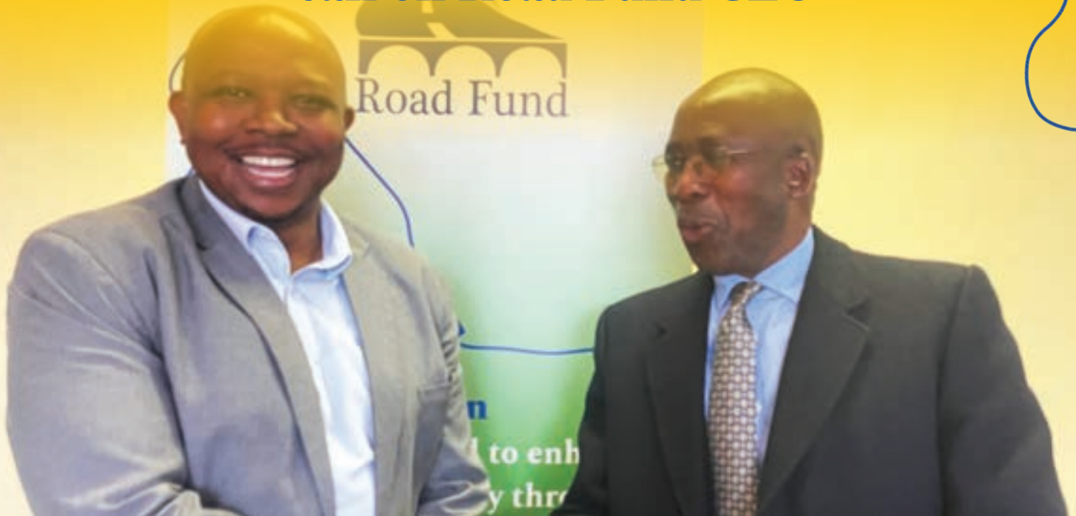
Road Fund CEO and MCC Town Clerk during the courtesy call