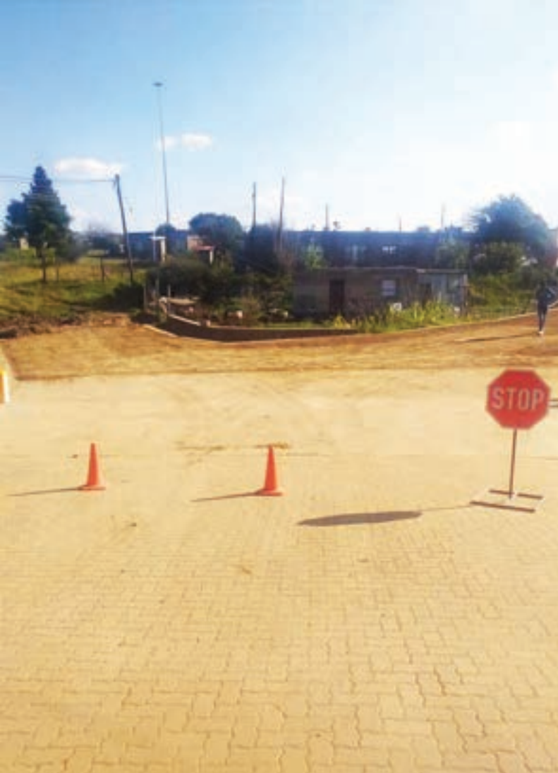
Construction of a Vented Ford at Motimposo