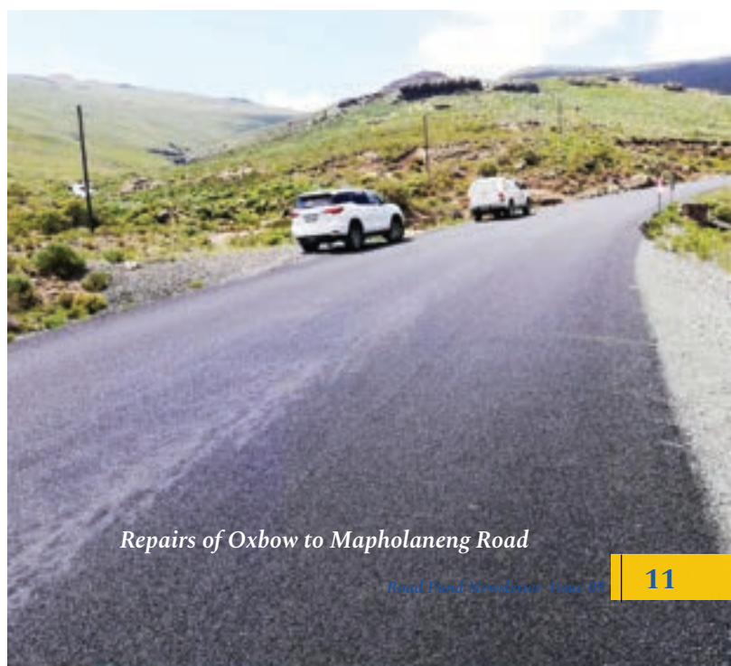
Repairs of Oxbow to Mapholaneng Road