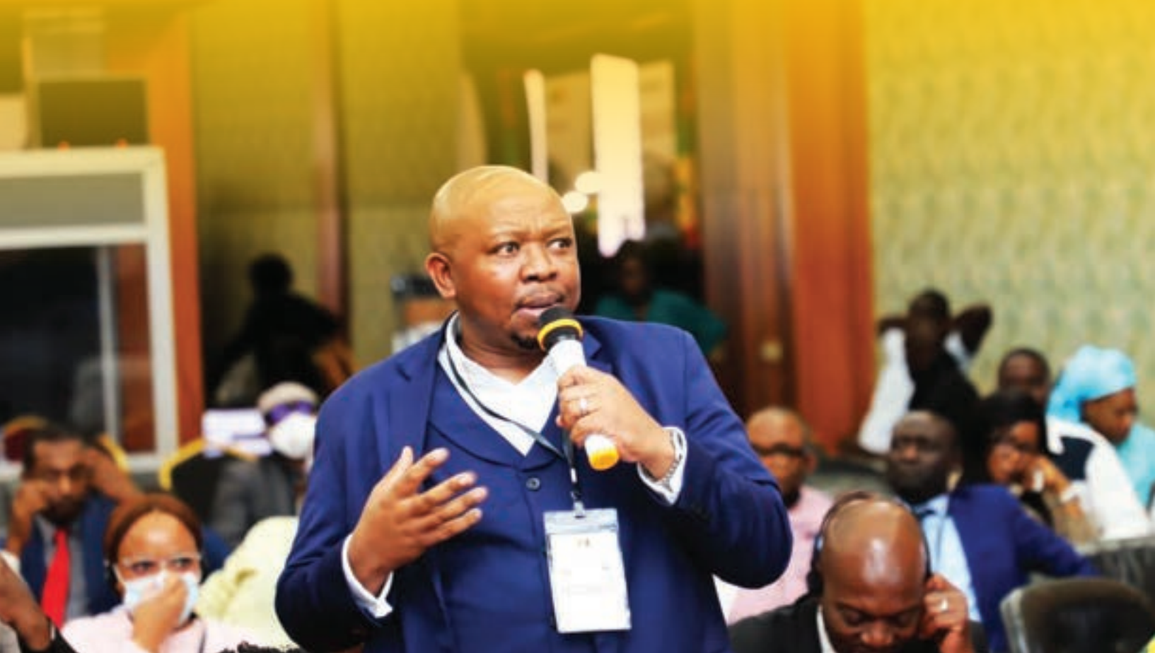
Road Fund CEO speaking during the ARMFA Annual General Assembly in Dakar Senegal

Participants at the African Roads Maintenance Funds Association (ARMFA) Annual General Assembly (AGA), hosted by the Road Fund in Senegal earlier this year have discussed and agreed that relations between Road Funds and Road Authorities in Africa need to be strengthened.