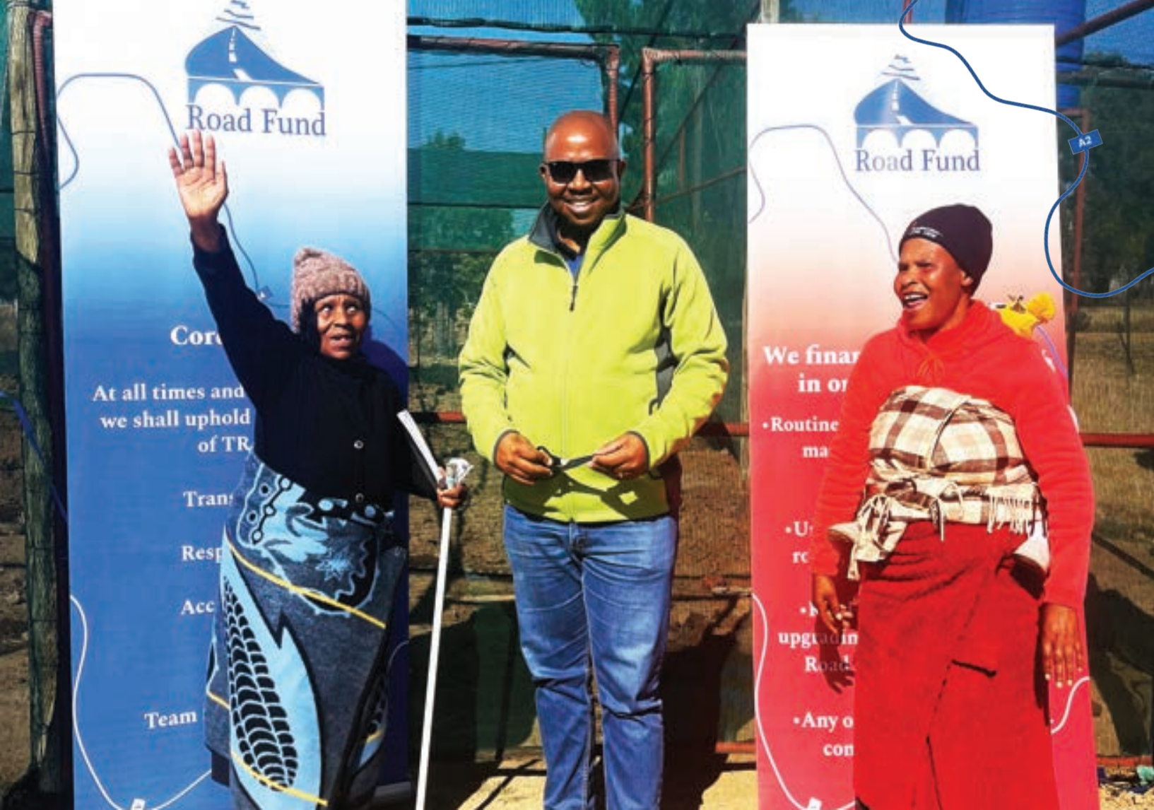
Road Fund CEO with beneficiary of the Sunshade Net and the Local Chieftainess