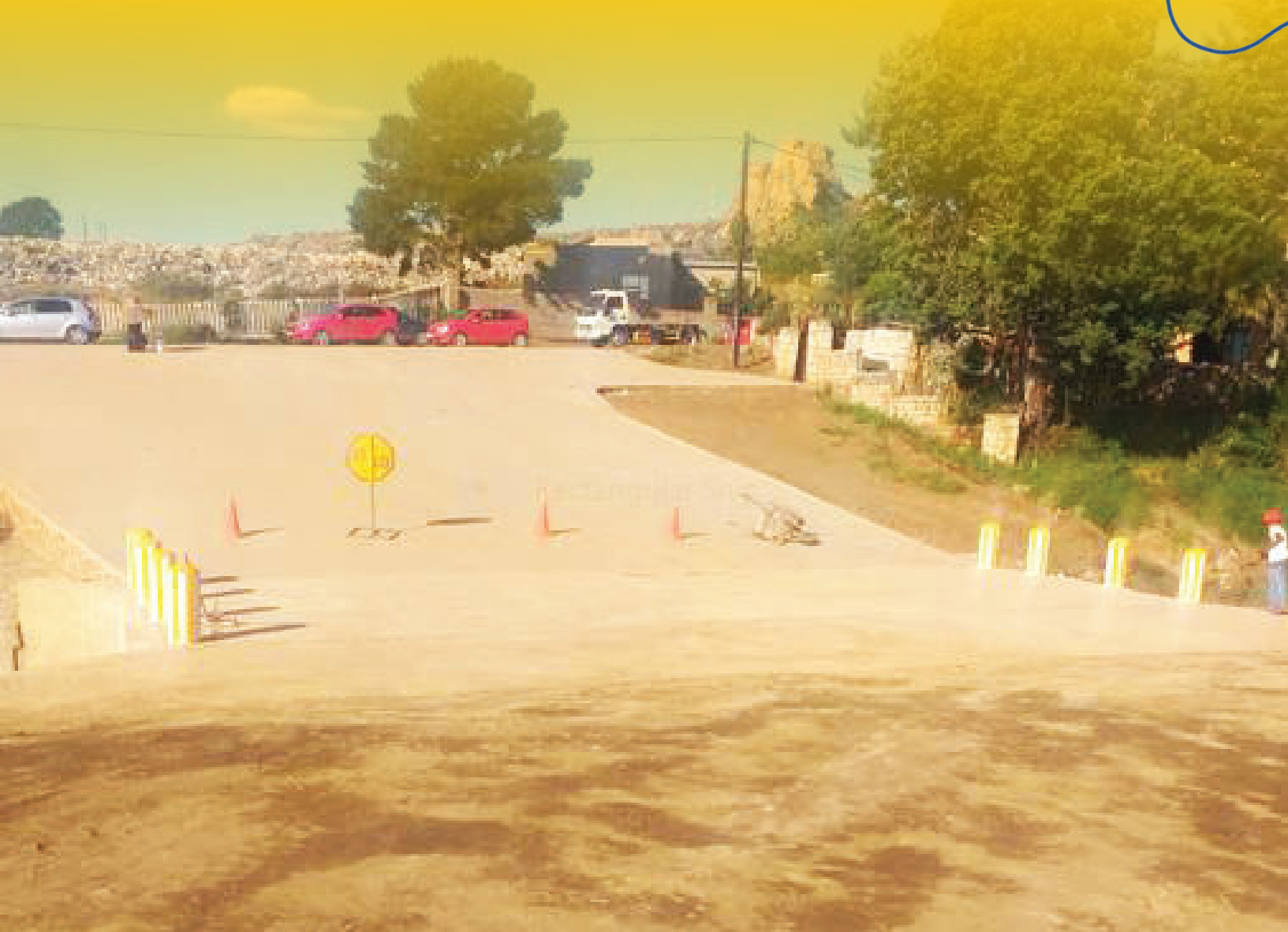
Construction of a Vented Ford at Motimposo

Maseru City Council has been financed by Road Fund to construct a Vented Ford at Motimposo in Maseru.