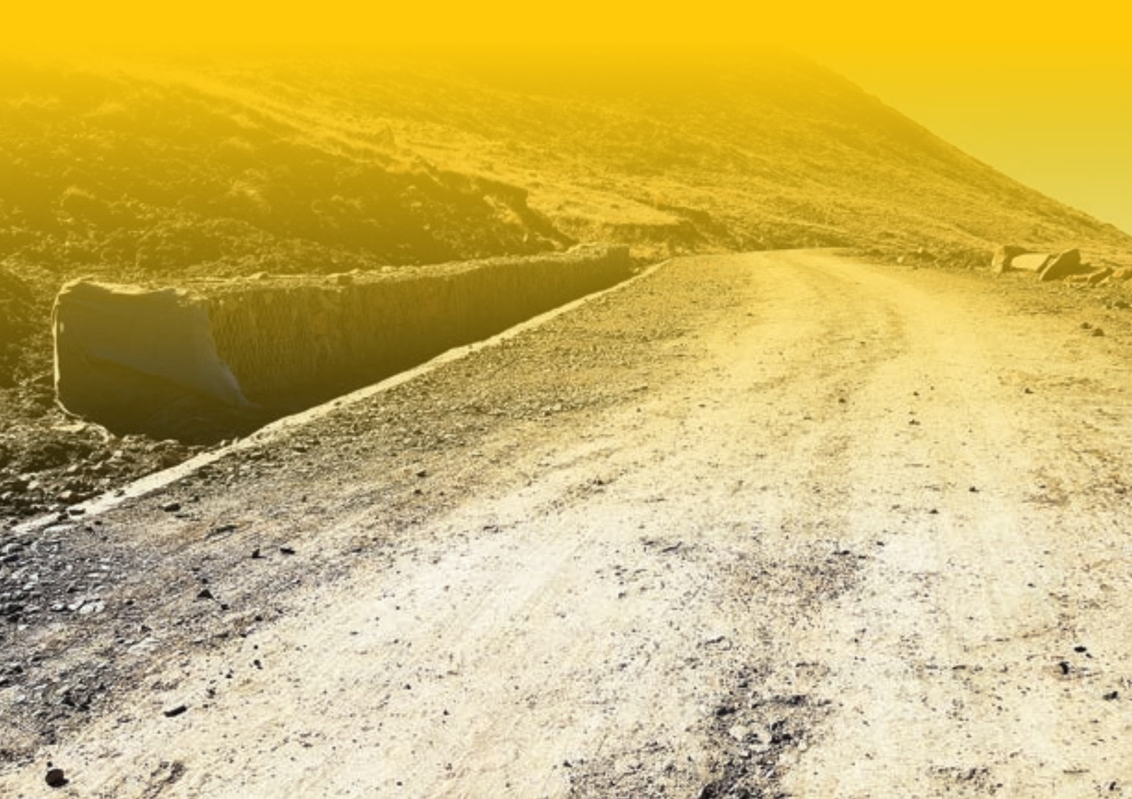
Periodic Maintenance of Bongalla to Maoela gravel road

In line with the Fund's mandate, which is to finance routine, emergency and periodic maintenance of roads, the Ministry of Local Government has been sponsored to undertake periodic maintenance of a gravel road at Bongalla to Maoela.