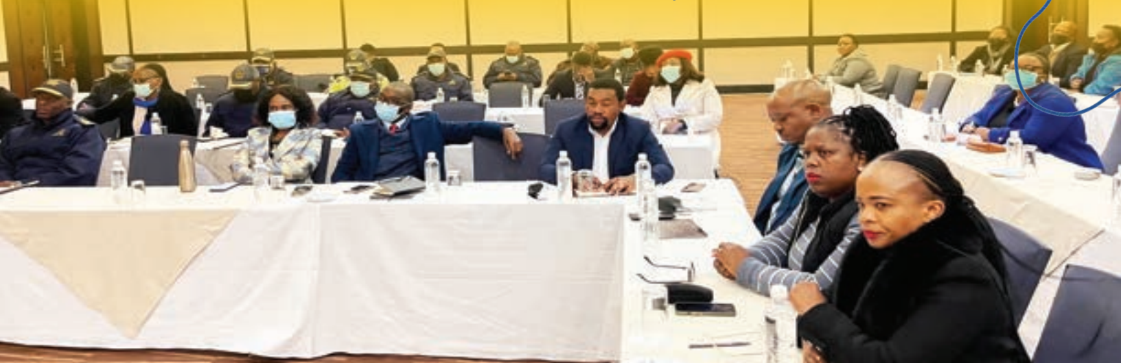
Part of Principals during the Automated Traffic Justice System briefing meeting

Principals from Road Fund, Lesotho Mounted Police Services (LMPS), Prosecution and Judiciary were briefed about the Automated Traffic Justice System during a meeting that was organised by the Automated Traffic Justice System development team in Maseru recently.