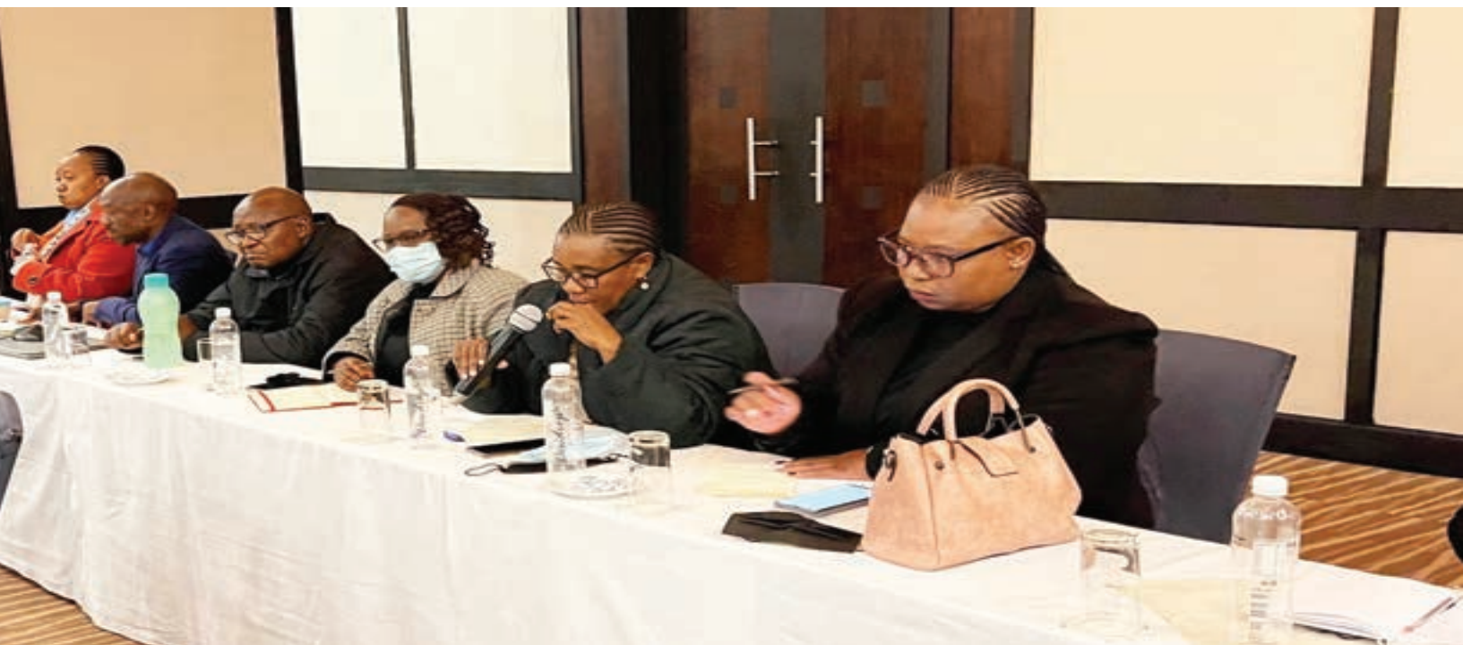
Part of the Automated Traffic Justice System Implementation Team during the briefing meeting