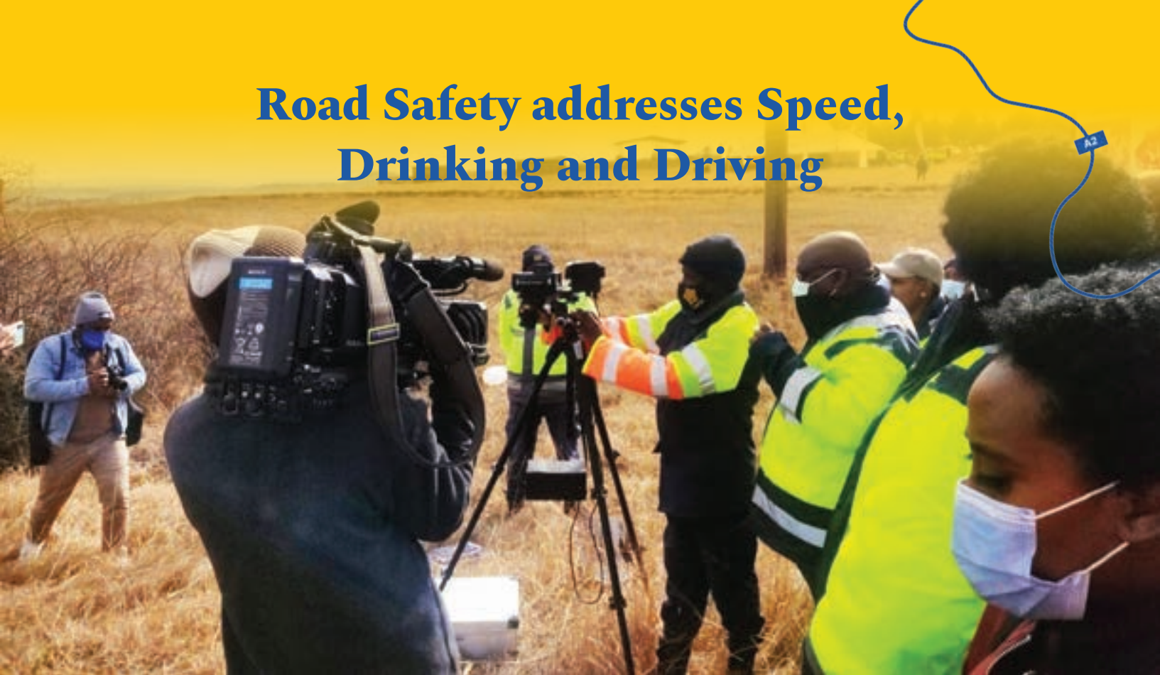
Minister of Transport orientated about the speed camera during the campaign launch

The Road Safety Department has launched a Campaign that is meant to address the increasing road crashes in the country, caused by amongst others, over speeding, drinking and driving.