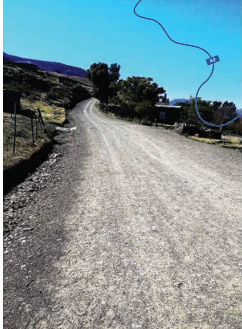
Periodic Maintenance of Bongalla to Maoela gravel road