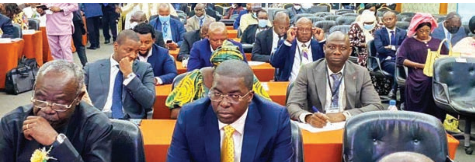
Part of Delegates at the ARMFA Annual General Assembly held in Senegal. Road Fund Lesotho was represented

ARMFA is a non-profit making and non-political association that was founded in the year 2003 in Libreville, Gabon. The aim is to provide a platform and establish a network for experience and information sharing on leading road maintenance practices in Africa; to discuss and find opportunities on funding options and to promote and strengthen links between members of African Road Funds.