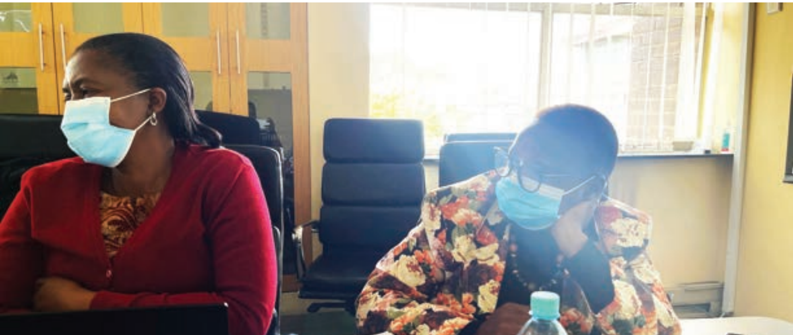
Part of participants at the Stakeholder Engagement Meeting