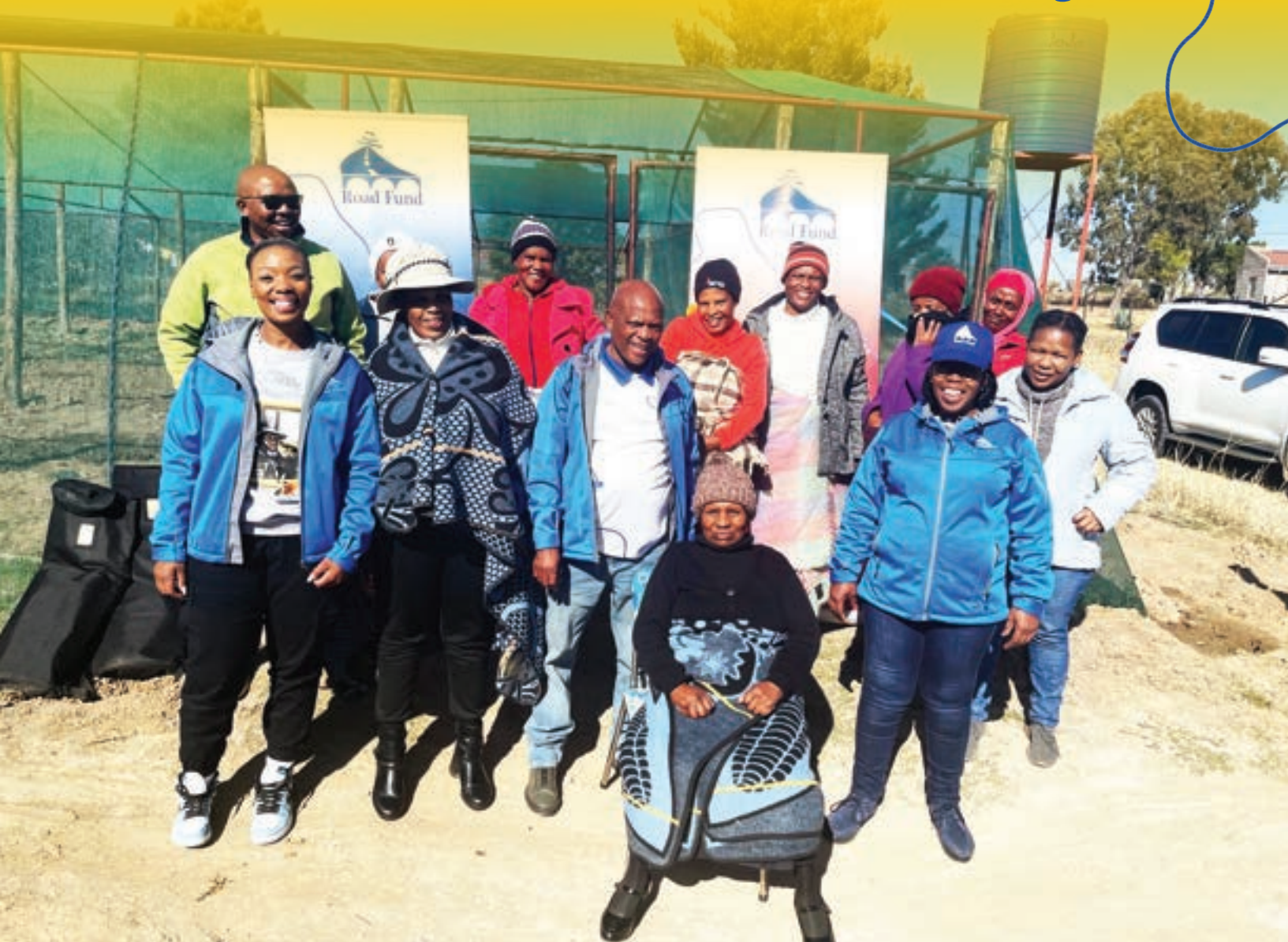
Road Fund staff and neighbours who attended the handing over ceremony

Road Fund extended its helping hand by donating a Sunshade Farming Net to a family of farmers to help them enhance their growing of vegetables at Ha Lebenkele, Mafeteng as part of its Corporate Social Responsibility (CSR) programme.