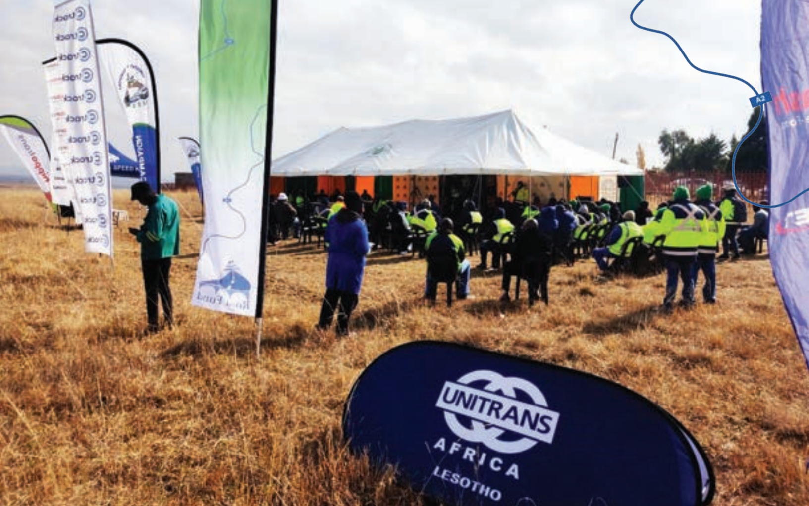
Minister of Transport orientated about the speed camera during the campaign launch