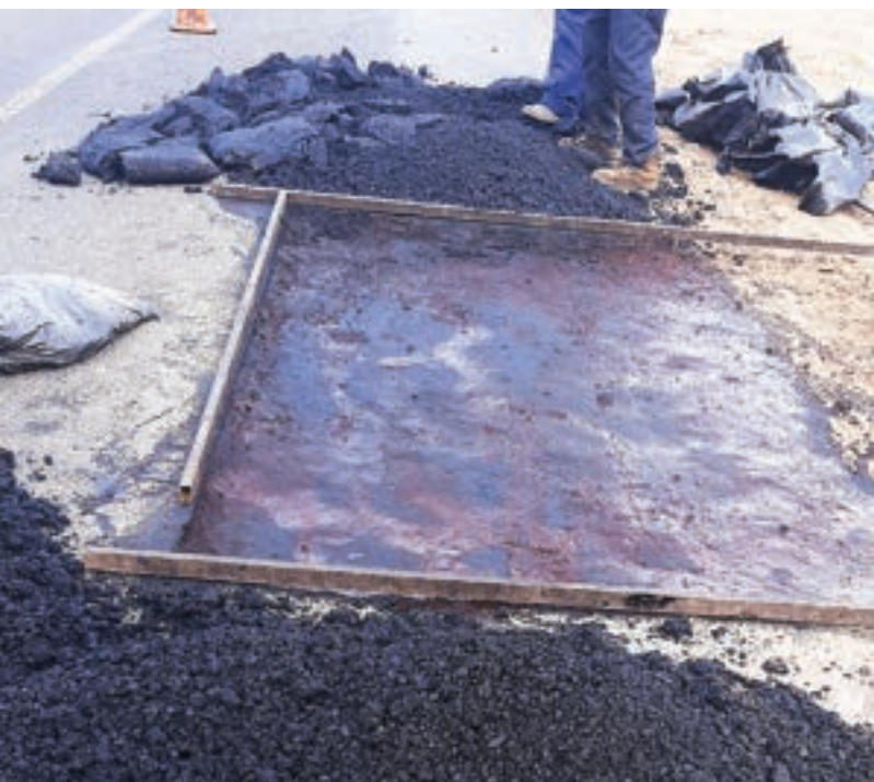
Routine Maintenance of 'Moteng to Oxbow Road