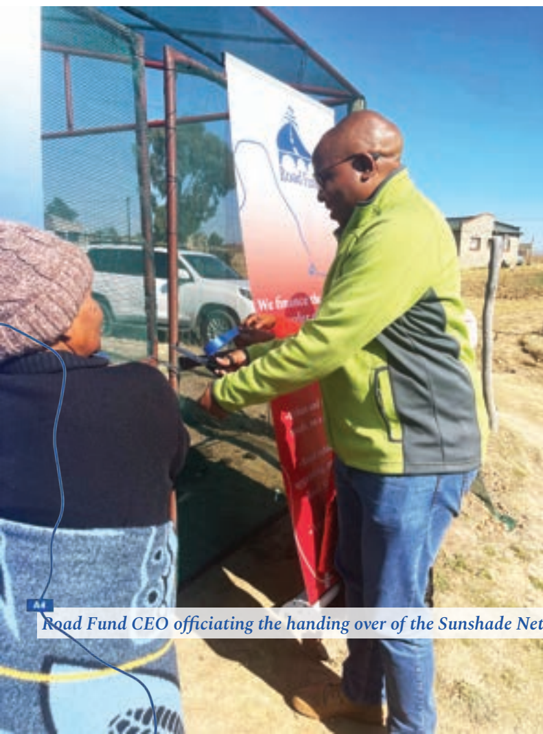
Road Fund CEO officiating the handing over of the Sunshade Net