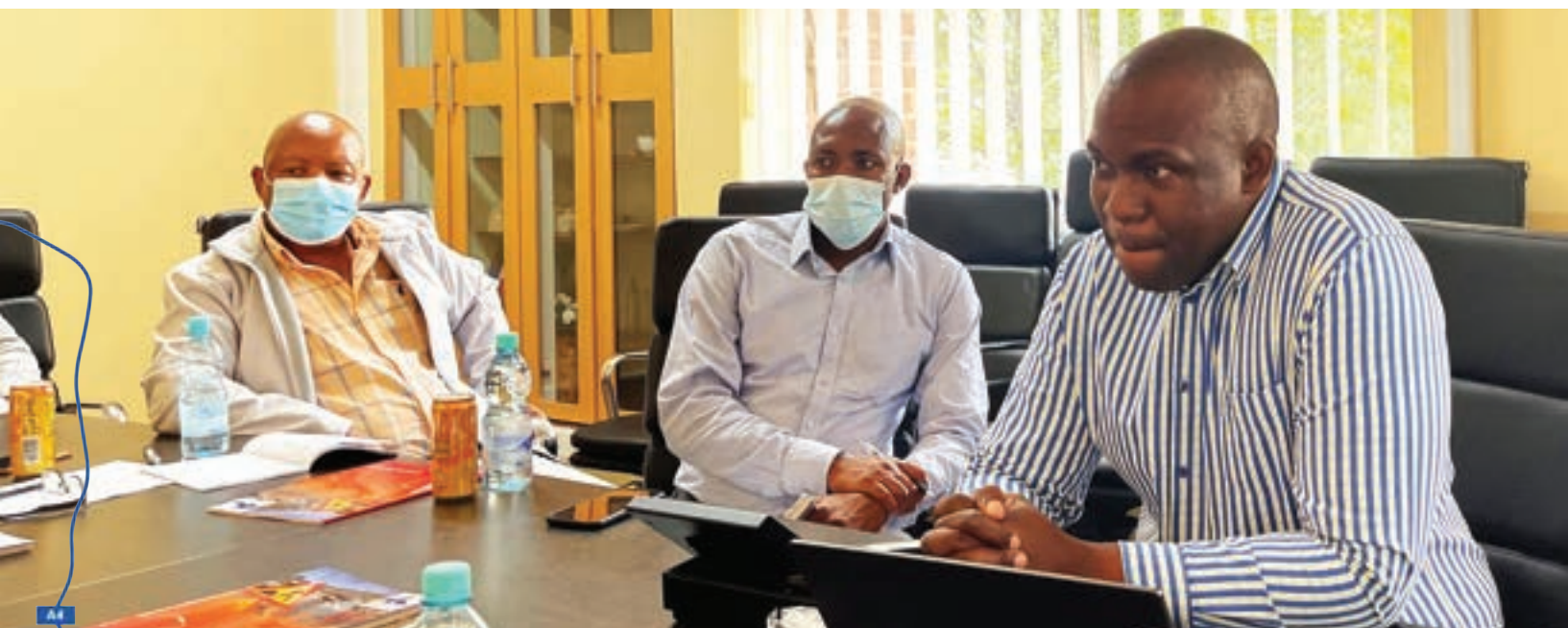
Road Fund Senior Secretariat Engineer and participants at the Stakeholder Engagement Meeting