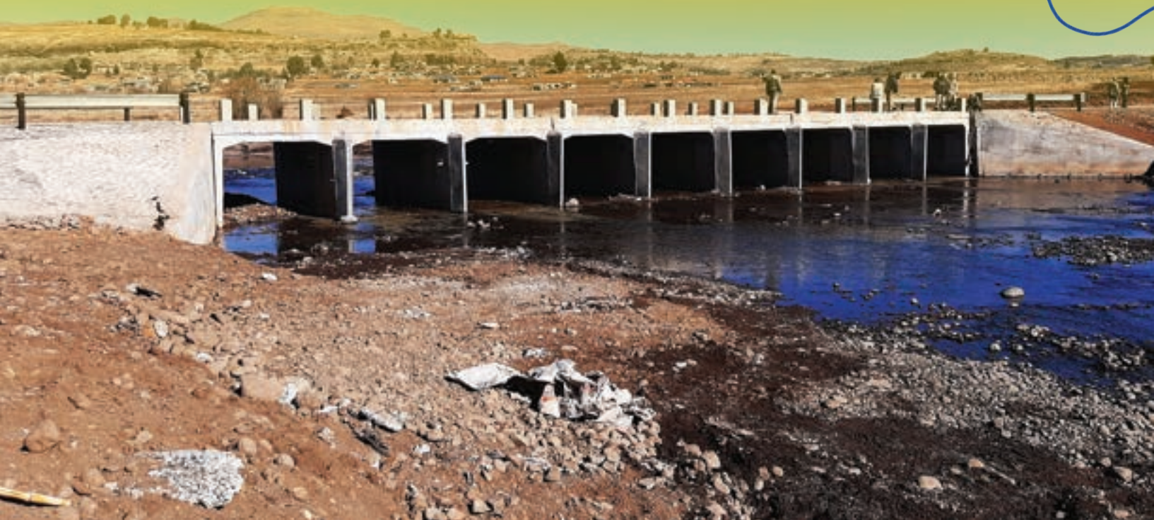
Plant and Design Build Repairs of Hlotse Crossing-Construction of a Mini bridge Konkotia to Pentsi

Road Fund has sponsored Roads Directorate to undertake plant and design repair of Hlotse Crossing along D1401 Konkotia to Pentsi.