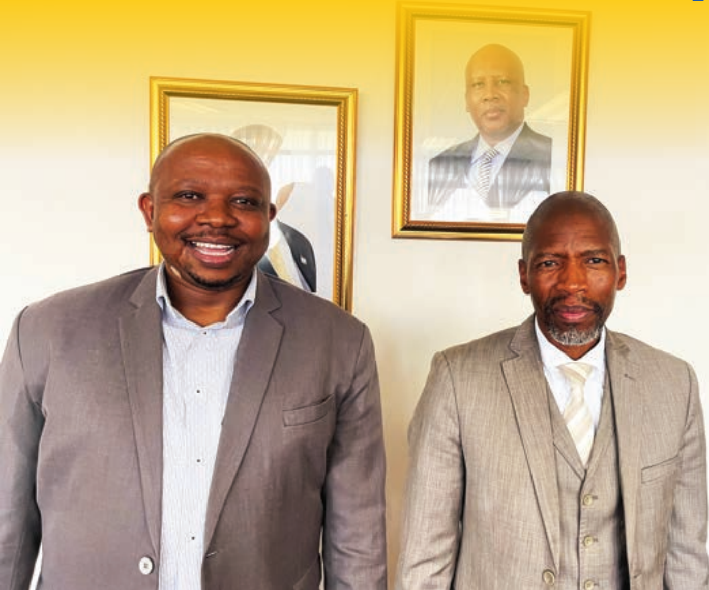
Minister of Local Government and Chieftainship with Road Fund CEO during their meeting

Healthy and sustainable stakeholder relations are one of the key ingredients in achieving the Fund's organizational goals.