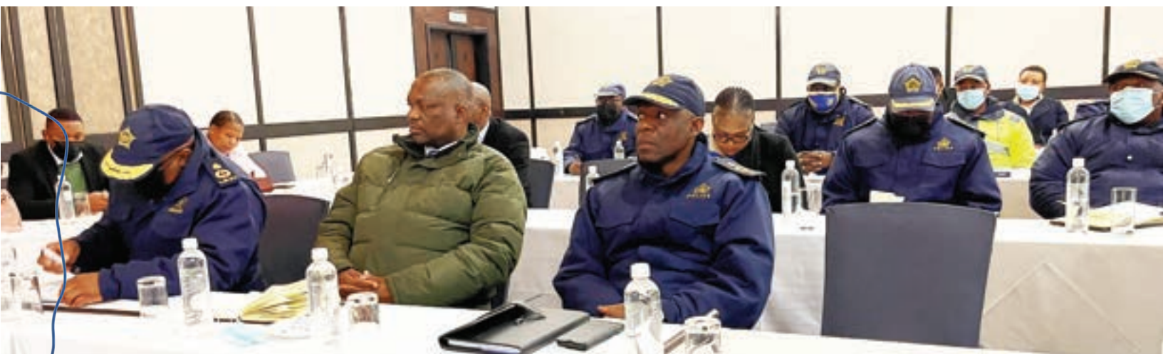
Commissioner of Police and LMPS Officials were part of the Automated Traffic Justice System meeting