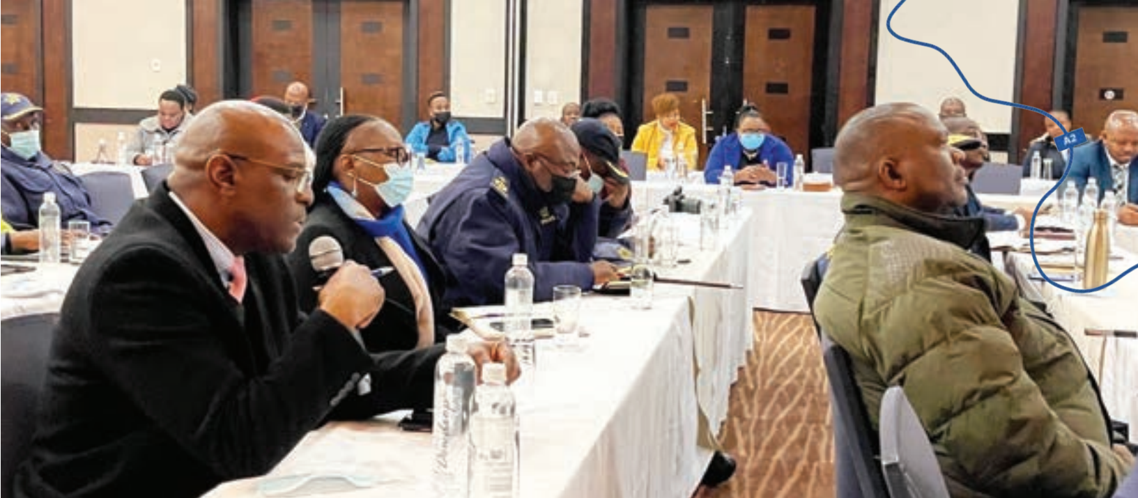
Participants at the Automated Traffic Justice System briefing meeting