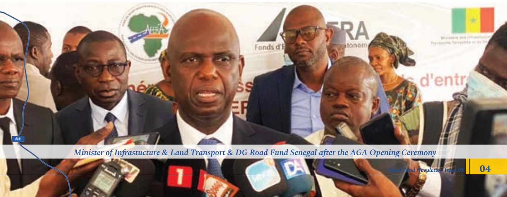
Minister of Infrastructure & Land Transport & DG Road Fund Senegal after the AGA Opening Ceremony