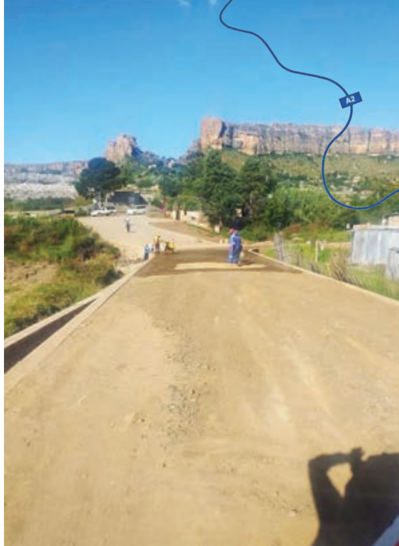
Construction of a Vented Ford at Motimposo