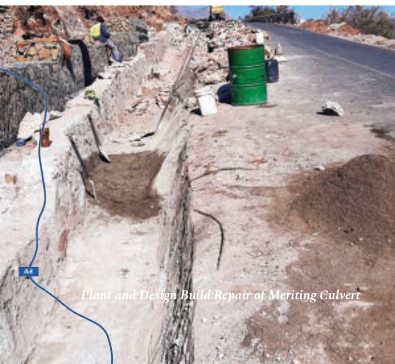
Plant and Design Build Repair of Meriting Culvert