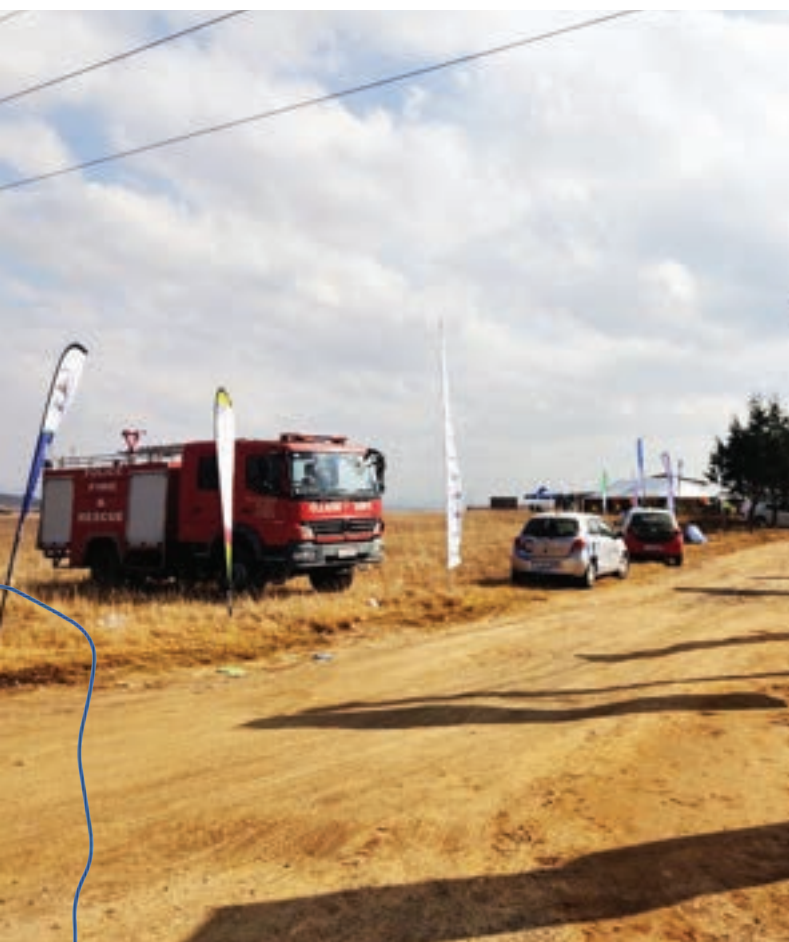
Display of publicity banners by sponsors during the launch